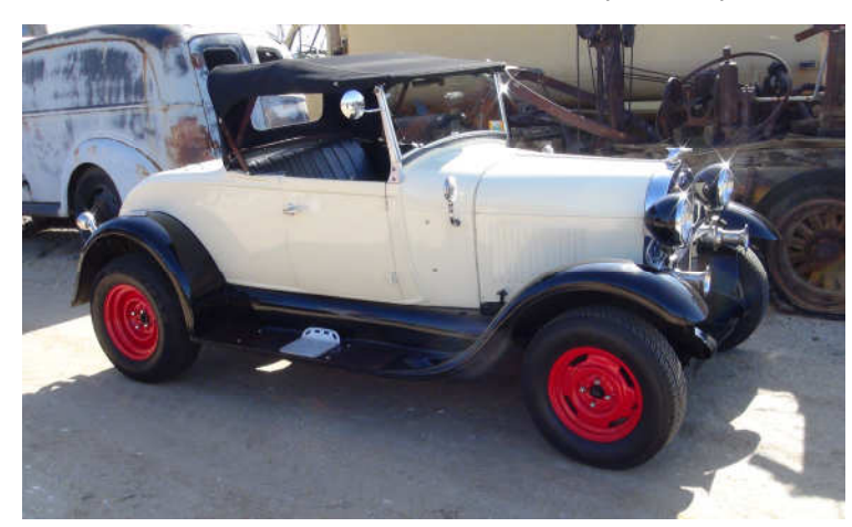
One of the restored antique cars visits the MTM during the Highway 80/94 Poker Run

The 20<sup>th</sup> of October was the busiest Saturday of this year for