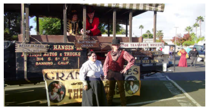
The "Grand Ladies of the Old West" and their troupe rode in the 1923 Mack in the Mother Goose Parade

Every year on the Sunday before Thanksgiving the City of El Cajon just east of San Diego sponsors the Mother Goose parade, the largest parade in San Diego County. This year the